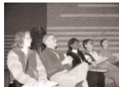
“Fastest Pen” contestants waiting for question.

pre-paid calling cards and gift certificates for each correct answer. The top prize is a whopping $200 value.